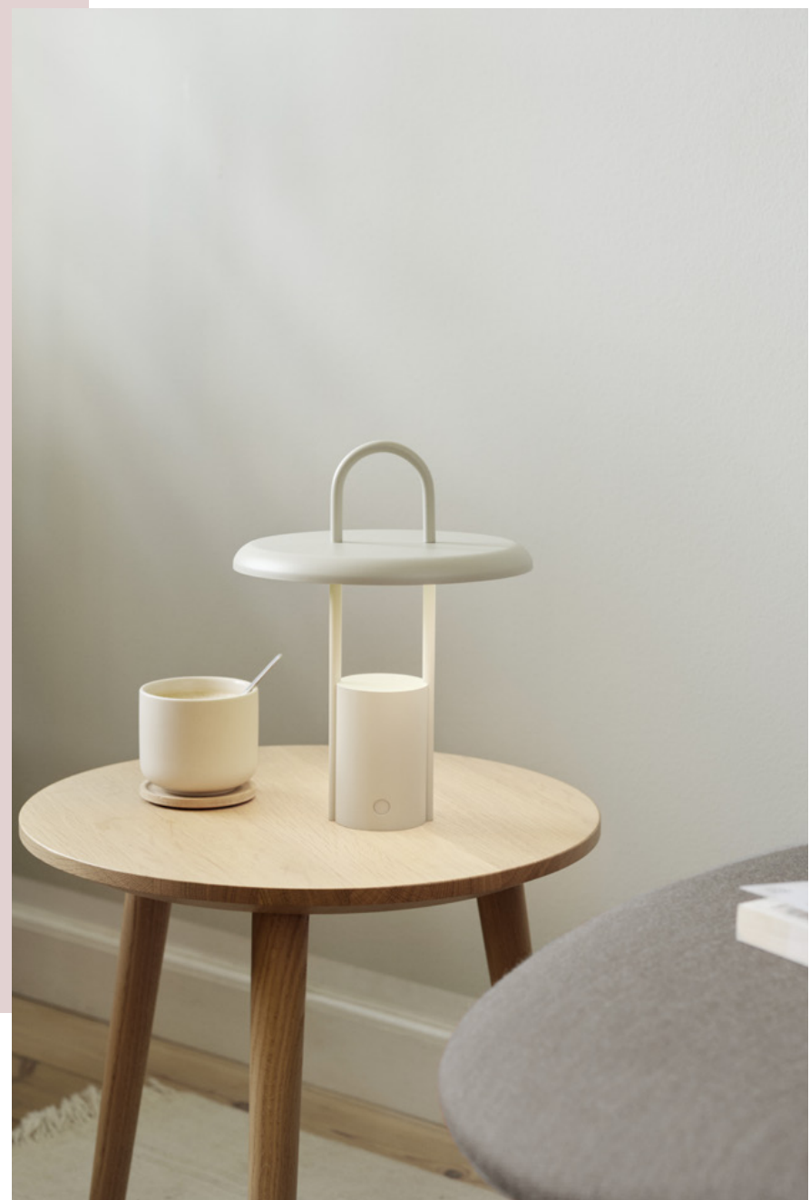
desserts and coffee.

Soft natural shades offset by a few mood-boosting splashes of colour bring a sense of calm to your interior. Enjoy the comfort and restorative benefits of a place you can call your own.