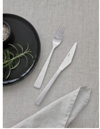
Maya – a Norwegian design icon. The Maya steak knife and serving spade make your dining experience even more delightful. Designed by Norwegian Tias Eckhoff and a timeless classic since 1962.