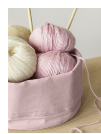
Use the classic bread bag, designed by Klaus Rath, as a multi-purpose bag for: yarn, toiletries or toys.